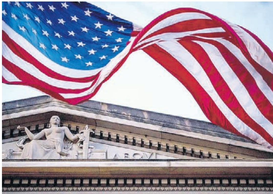
An American flag flies outside the Department of Justice in Washington, March 22, 2019.

The Biden administration has tried to go after hackers who have held U.S. targets essentially hostage, often sanctioned or sheltered by adversaries. The threat gained particular prominence in May 2021 when a Russia-based hacker group was accused of conducting a ransomware attack on Georgia-based Colonial Pipeline, which disrupted gas supplies along the East Coast.